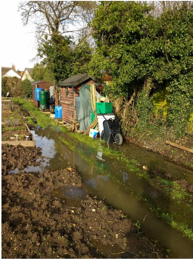
The Allotments also floods see pictures below